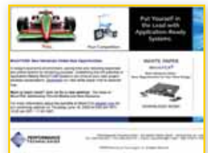
Dedicated Email Blasts & Lead Generation Programs