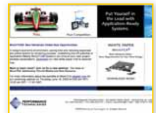
Dedicated Email Blasts & Lead Generation Programs