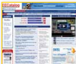
Technology Specific Websites