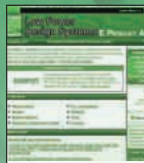
Monthly Email Newsletter