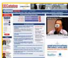
Technology Specific Websites