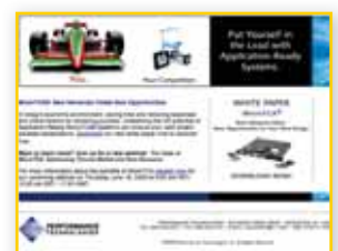
Dedicated Email Blasts & Lead Generation Programs